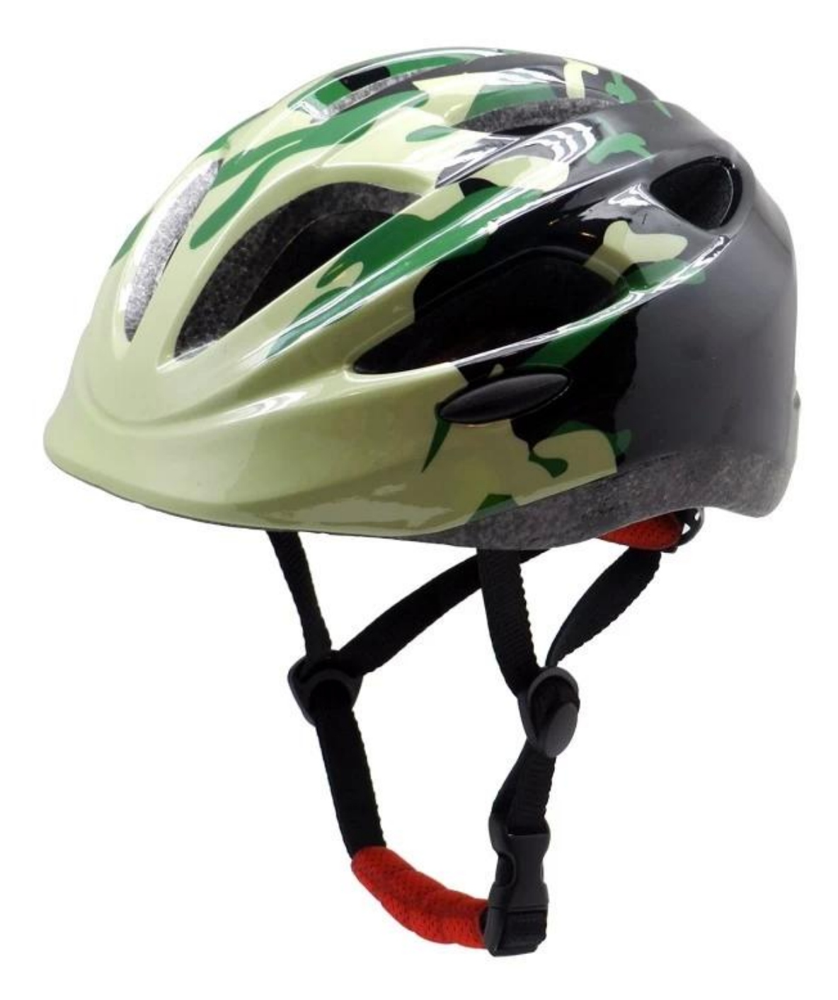
The knowledge of helmet headform: