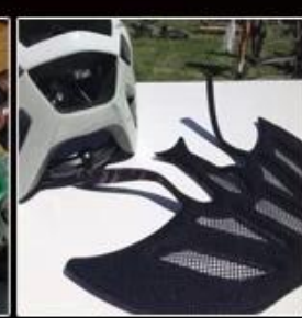
1. Trend predictions