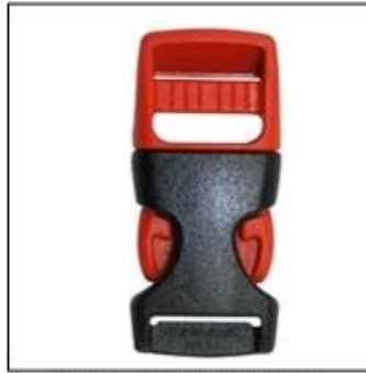
ITW standard helmet buckle