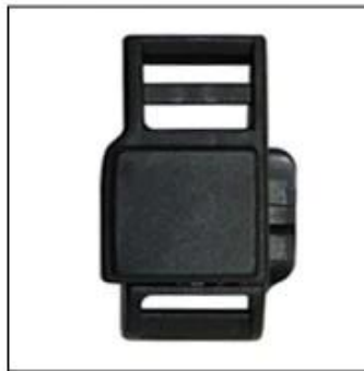
Patent self-developed magnetic buckle