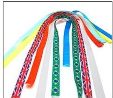
Available colored/patterned strap