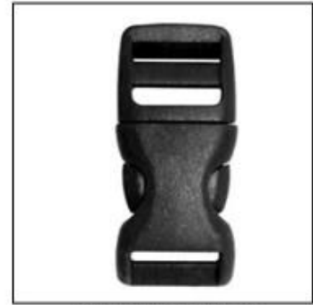
Traditional helmet buckle