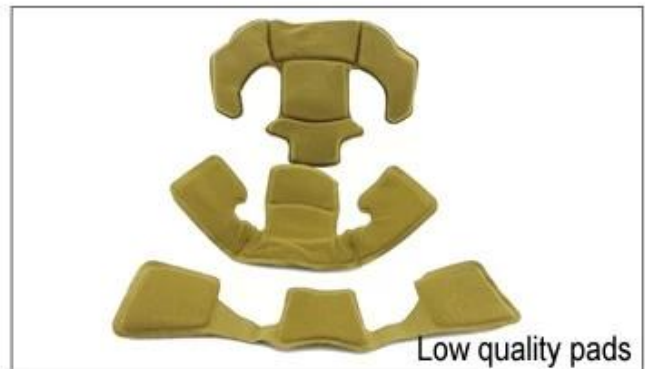
Low quality pads

Breathability and comfort are extremely important, that's why the Manta features Airlite straps which are 15% lighter than a standard helmet strap. Teton straps are lighter, stronger and more breathable than a normal helmet strap. They also do not stick to the face as easily when temperatures begin to increase. Fast Adapting System webbing can be easily and continuously tailored to your exact head shape. The helmet stays securely on the head in all situations and the webbing straps are always in the best position.