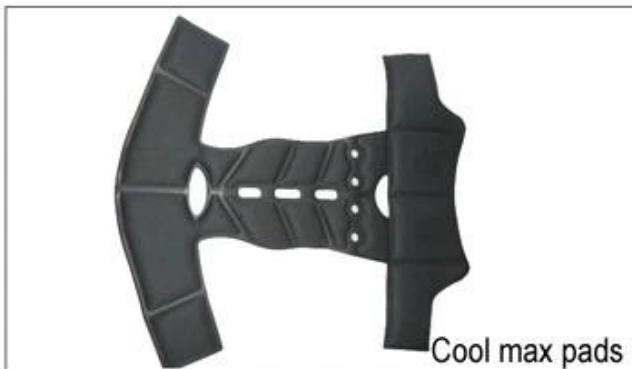
Cool max pads