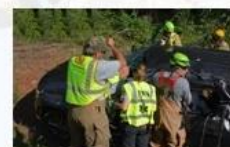
Rescue and evacuation