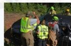
Rescue and evacuation