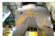
Big wall climbing