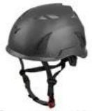
Grey pantone 432 C